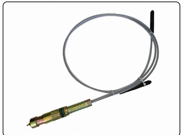
[Model 2391A,B ass'y]