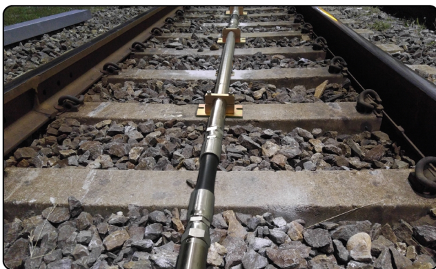
[Installation of ACE-RTM for sleeper]