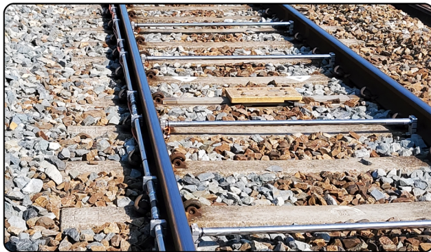
[Installation of ACE-RTM for rail]