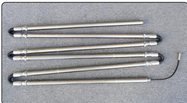
[Bundle of ACE-RTM]

The ACE-RTM connects the sensors of all points by the sequential serial communication type of one-line cable. It can be remotely measured using our ADL-200A smart logger and wireless modem.