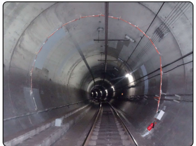
[ACE-TCS in Seoul subway]