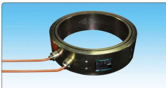
[1000ton of VW load cell for bridge installation]