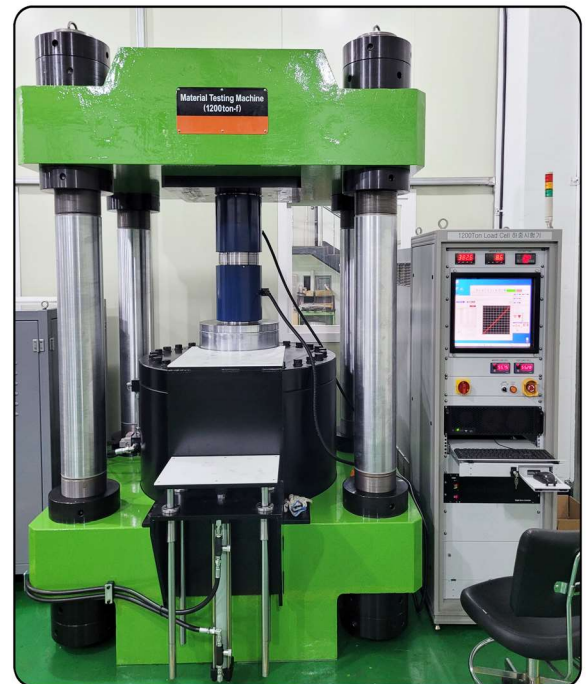
[1200ton-f Material testing machine]