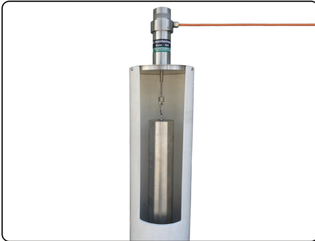
[Outline of VW weir monitoring system]